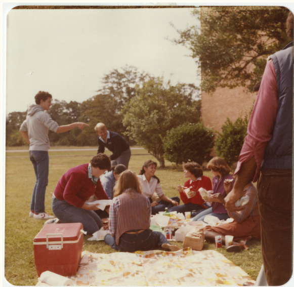
Caption: RCC Staff picnic on the lawn circa 1965 For more photos check out Digital NC