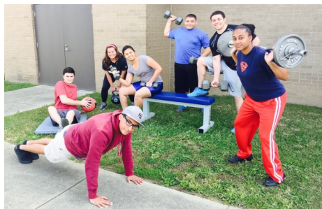
The PED 117 Weight Training class stops to pose during a workout.