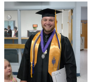
2015 Spring RCC Graduates

Celebrating the accomplishments of our students—